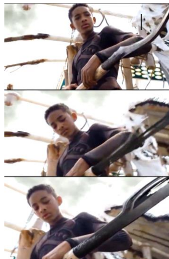
Figure 3 - In the movie After Earth , Kitai, the protagonist, finds a white rod in the wreckage of his space ship. Picking it up, Kitai demonstrates how multiple rods can extrude out of both its ends, much like the previously discussed relief style displays. However, instead of displaying information, these rods take on the form of various weapons or tools. The shape change here is not used to represent information, rather, similar to a swiss army knife, the shape change allows the tool to take on multiple functions.

representations of data include Lumen [15], inForm [5] and EMERGE [17], which consist of arrays of actuated rods which can move up and down, creating faux 3d reliefs. These displays are also prominent in SciFi narratives, as seen in the screenshots taken from X-Men (Figure 2).