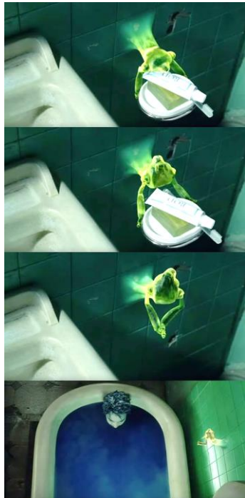
Figure 1 - A fictional example can be found in the movie Immortal (Ad Vitam): a bathroom appliance which, within its sphere of influence, supports users of the bathroom both by providing them with the objects they might need (in this case, toothpaste) for a given task and by providing them emotional feedback to their current state of mind